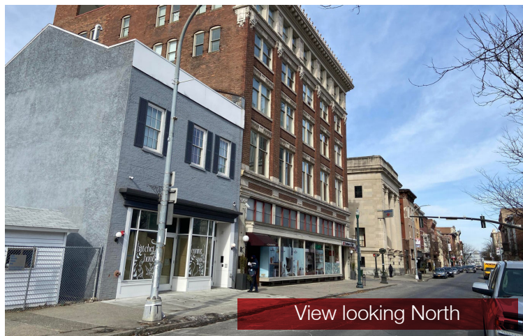
View looking North