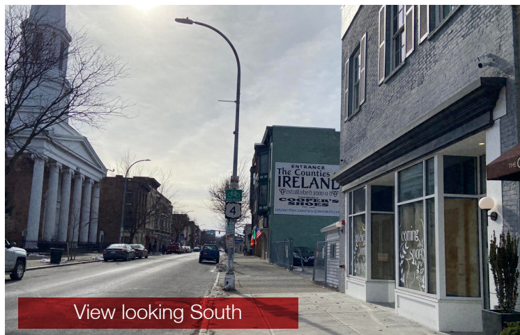
View looking South